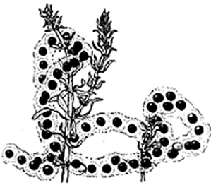
Figure 3 Drawing of toad spawn from Wildlife of greater Brisbane , page 166

Compared with native species, cane toad egg production is dynamic and a single clutch can contain up to 35 000 eggs. Remove any cane toad eggs found in the water and allow to dry out.