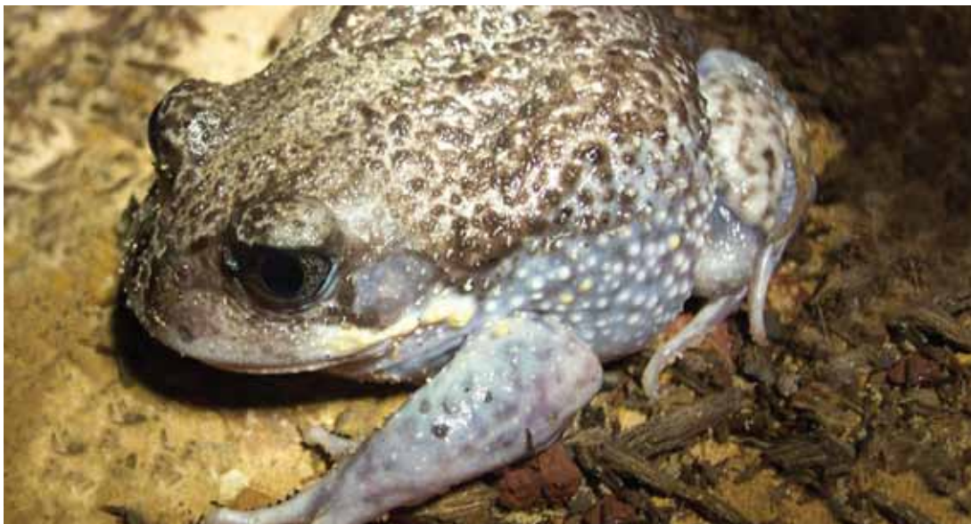
Figure 1. Native giant burrowing frog ( Heleioporus australiacus )

Bufo comprises about 150 species of true toads found throughout most of the world, except for the Arctic, Antarctic, Australia, New Guinea and neighbouring islands. A unique feature of Bufo is a large parotoid gland behind each eye (Wikipedia 2009b).