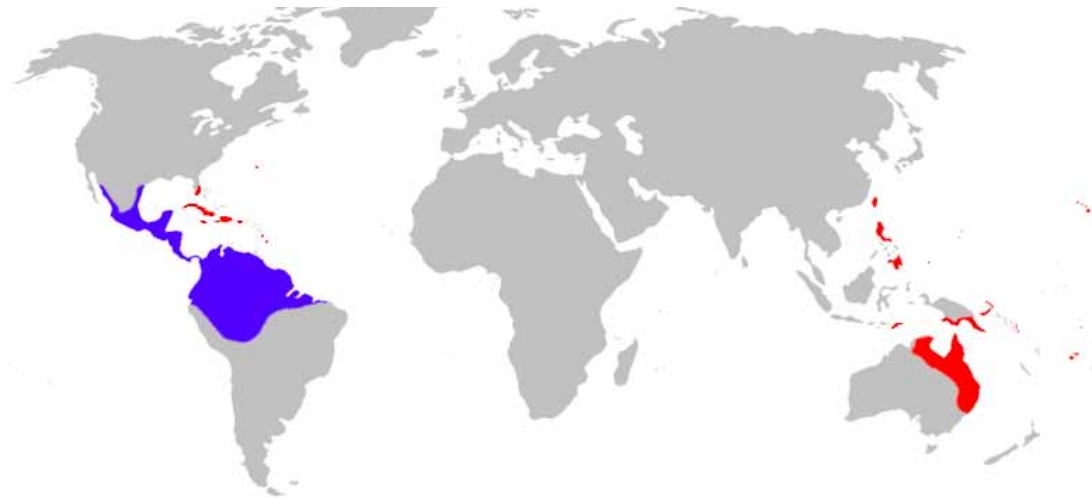
Figure 2. Worldwide distribution of Bufo marinus —blue areas indicate native distribution and red areas indicate naturalised distribution