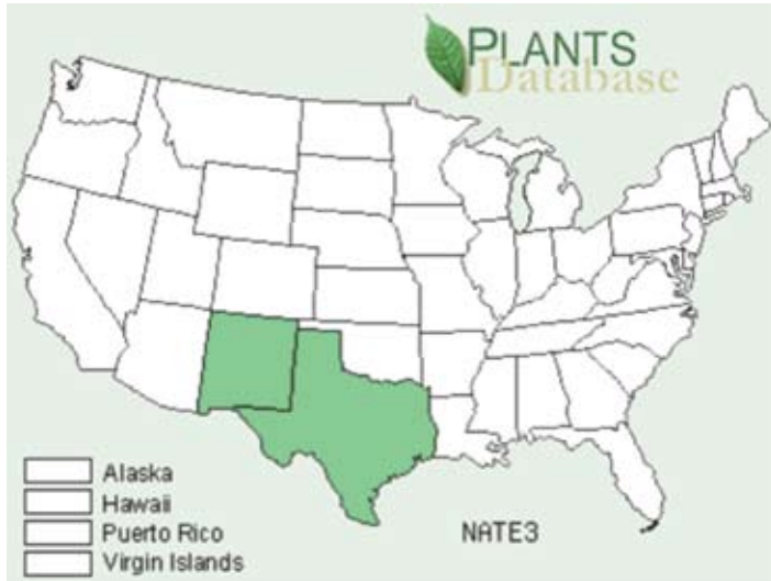
Figure 1. Distribution of Mexican feather grass ( Nassella tenuissima ) in the United States (PLANTS database, US Department of Agriculture, http://plants.usda.gov ).

Mexican feather grass is native to Argentina, Chile, New Mexico (US) and Texas (US) (Jacobs et al. 1998). Its distribution in the US is provided in Figure 1 and in Mexico in Figure 2. A map of distribution in South America is not available.