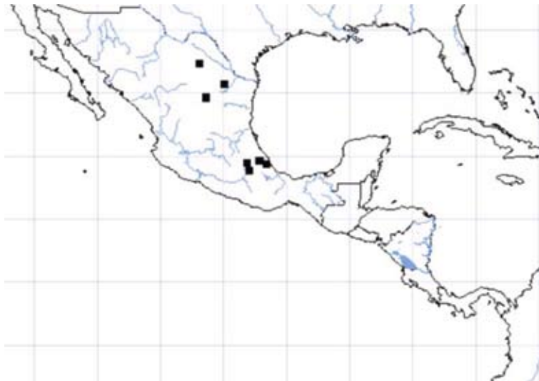
Figure 2. Distribution of Mexican feather grass ( Nassella tenuissima ) in Mexico (Missouri Botanical Gardens w3 TROPICOS database).

In Argentina, it grows in the central, western, southern and north-western regions, extending from about 26°50'S to 47°34'S, and from near sea-level to about 2900 m altitude (Jacobs et al. 1998).